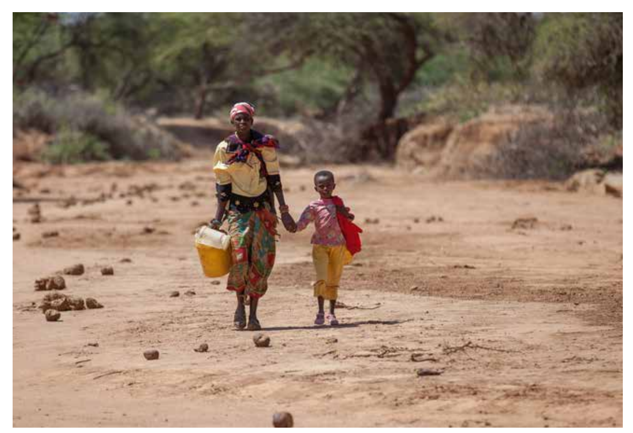
Walking long distances for water is unpaid work that falls on women and girls. Private companies rarely invest in new infrastructure in remote communities where there is little profit to be made.

SDG6 commits countries "to ensure availability and sustainable management of water and sanitation for all by 2030" with eight distinct goals ranging from access to water, to improved water quality, and better sanitation and hygiene. In practice there are many gaps. Over 2 billion people lack access to water that meets the new SDG standards and 844 million lack access to clean drinking water, whilst 2.3 million lack basic sanitation – an area where progress has been shockingly slow. There are huge inequalities both between and within countries, with half of the people drinking water from