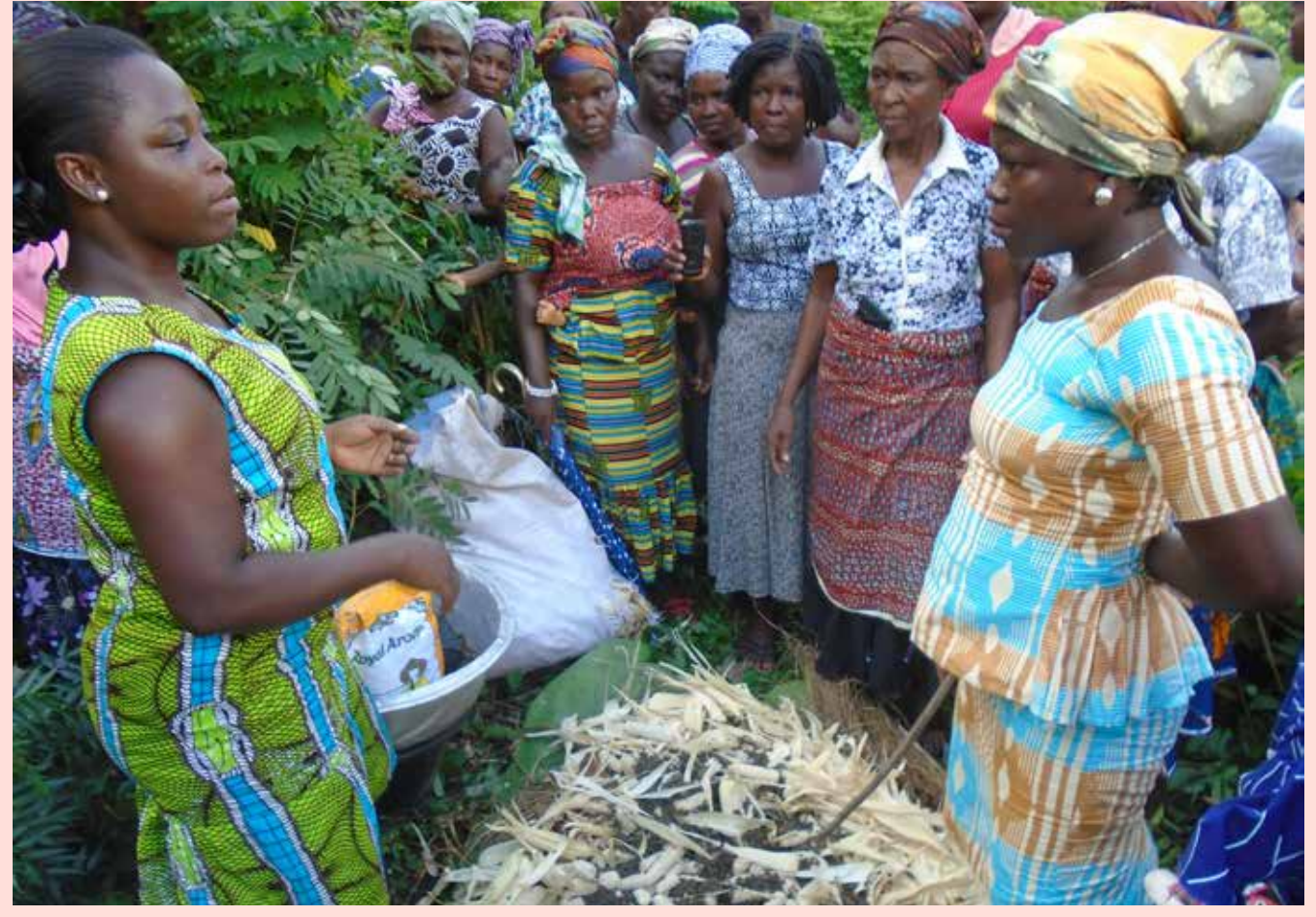
The priority for public investment in agricultural extension services is to support women smallholder farmers.

The Female Extension Volunteer (FEvs) programme in Ghana resulted from ActionAid's support for communities through participatory reflection processes. In these processes, a farmer-led extension support programme was identified as a way of bridging the extension gap. Selected female farmers identified as natural leaders in their communities were trained in agroecology practices and basic extension delivery methods. The FEvs were also supported with simple tools and logistics to enhance their work. The main focus of the FEvs is to promote agroecology and support smallholder farmers' transition to climate resilient sustainable agriculture. This programme has helped women smallholder farmers to take control of their agricultural production and food sovereignty, leading to increased and more sustainable agricultural production with less dependence on external inputs (e.g. through developing local seed banks and using crops residues for compost) and better connections to government agriculture extension services and other support programmes.