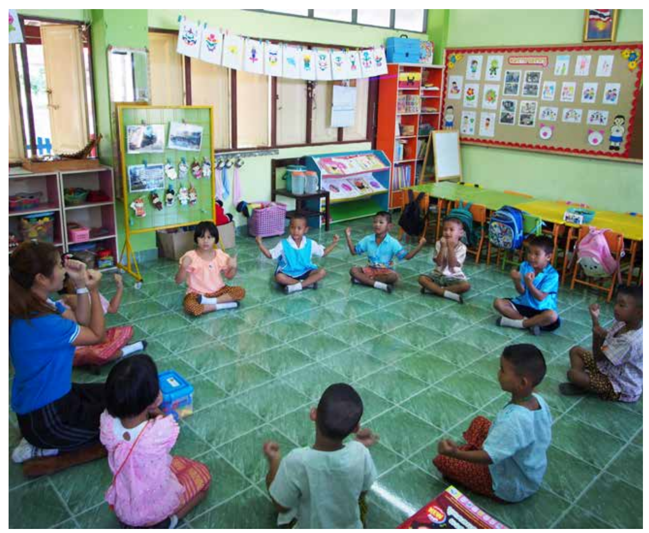
School in Supanburi Province, Thailand. Education budget constraints mean small schools in rural areas are threatened with closure. But these school are often the only hope that many children have for getting an education. Abolishing unnecessary tax incentives could transform the education budget

Rationalising tax incentives and removing the most harmful ones, including tax holidays and discretionary tax incentives which pose the largest challenge in terms of transparency and accountability, has thankfully become part of the standard advice of the IMF, as well as many other actors. While cost-benefit analyses of tax incentives remain a challenge in terms of providing a reliable insight into the real value of such measures, there are some promising experiences from countries like the Dominican Republic and international organisations supporting this area of research.<sup>339</sup>