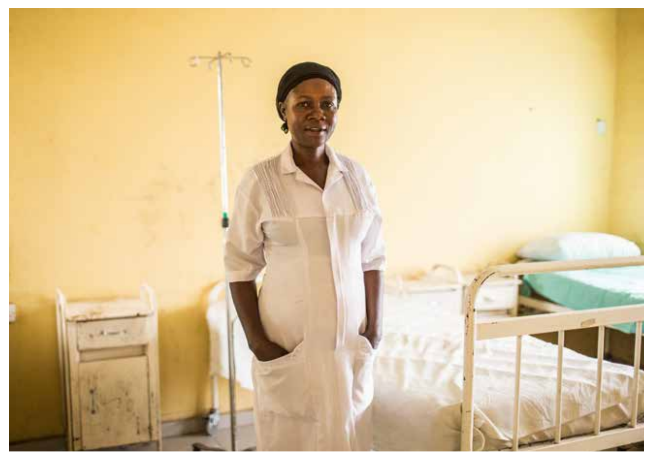
Orji is an unpaid nurse and midwife in a local hospital with no water source, no electricity and no government funding.

interviewed said they were working as volunteers, still pending confirmation of promised employment contracts from government, sometimes for several years. Those health extension workers who were employed by the government were untrained and ill-equipped and, complained of being so badly paid that they were unable to cater for their basic needs like transport and food. As a result, many health facilities are only open for 4-6 hours a day as is the case for example in Owode Oja community in Kwara State where the center opens at 10 and closes at 2pm and is unavailable at other times of the day regardless of the emergency. When emergencies do arise, women often have to go to general hospitals that are located 3 to 4 hours away from the community.