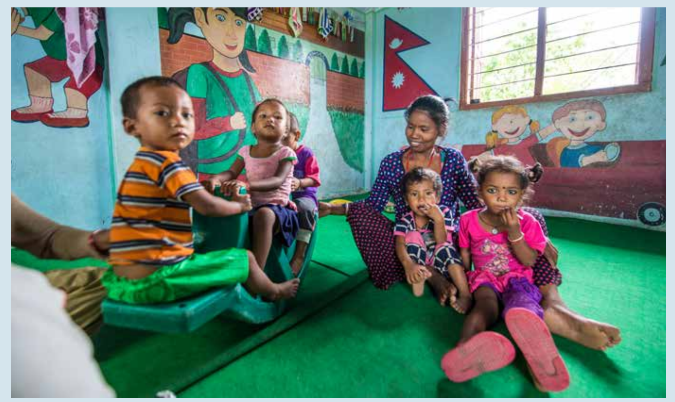
Community Child Care Center established in 2015, Bardiya, Nepal.

After the CCC, I have started cultivating vegetables and managed time to travel Nepalgunj and Mainapokhar (local market) to see them. I have also started livestock farming. Sometimes I go work as a wage labourer. This has tremendously boosted our family income. Earlier, since were unable to pay fees, school asked us to stop sending my daughter. Now, we manage it easily. This has also reinstalled the self-belief that I will do the work, earn and educate my daughter. I have also managed to invest in some capital. We bought a small piece of land in my name and took some land in mortgage. I have also started regularly saving some amount in the local saving group. Now, my family do not have to worry about food, clothes or education. We have been able to uplift our condition. My husband now works here in Nepal. He supports me with cultivation of vegetables, looking after cattle, and supports me in household chores. Even my younger son is developing and learning well in the CCC.