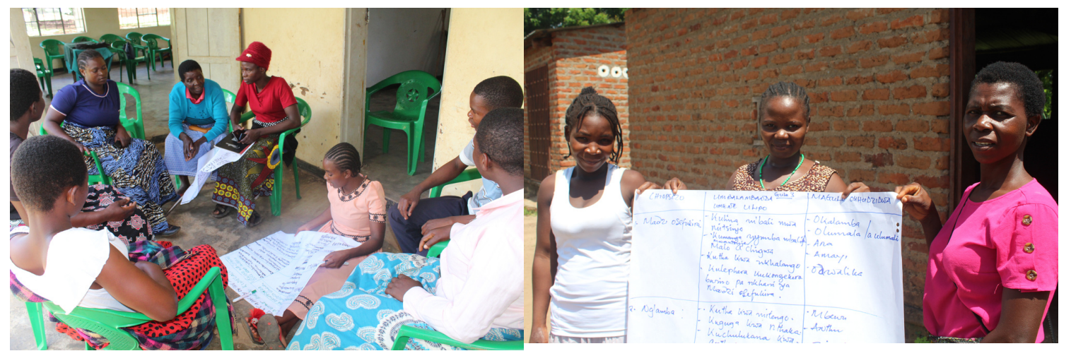
Part of disaster preparedness exercise in Phalombe and NsanjeLocal Rights Programmes