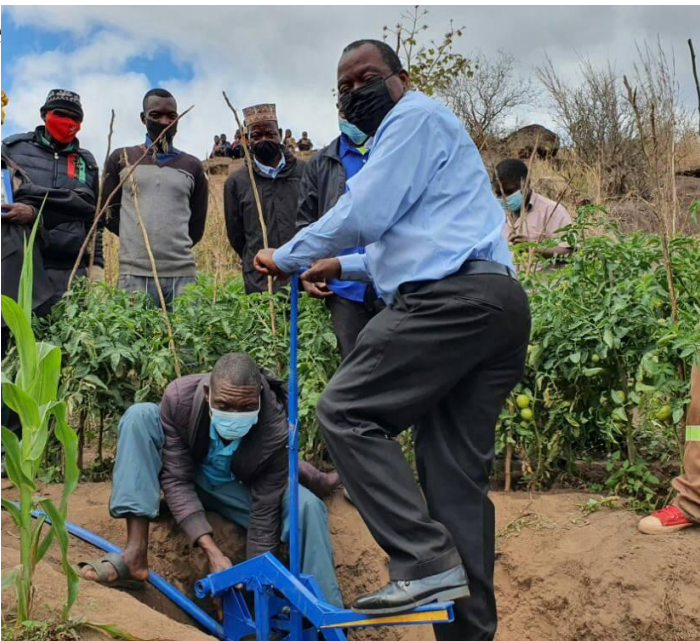
Golowa demonstrating how the treadle pumps operate