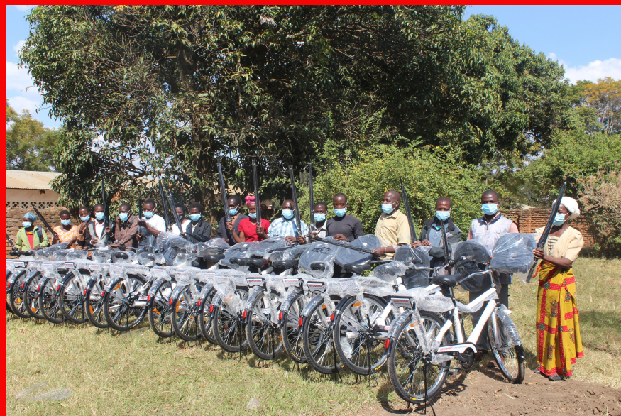
Mentors and caregivers in Lilongwe posing with their items