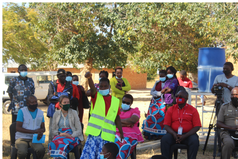
A mentor at Mtende Safe Space facilitating the discussions and below is part of the gathering at the meeting