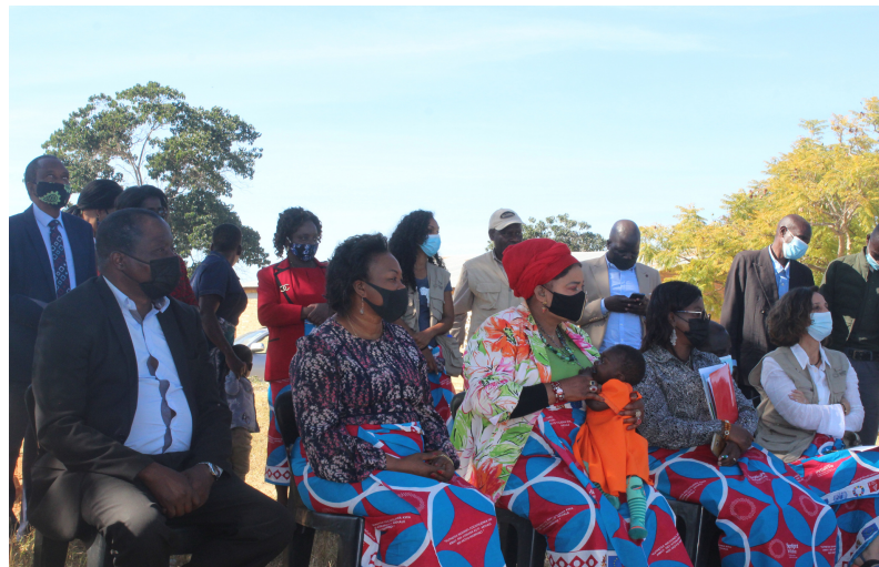
Delegates following discussions during the safe space

ActionAid Malawi is implementing the Spotlight Initiative projects in Mzimba and Ntchisi districts.