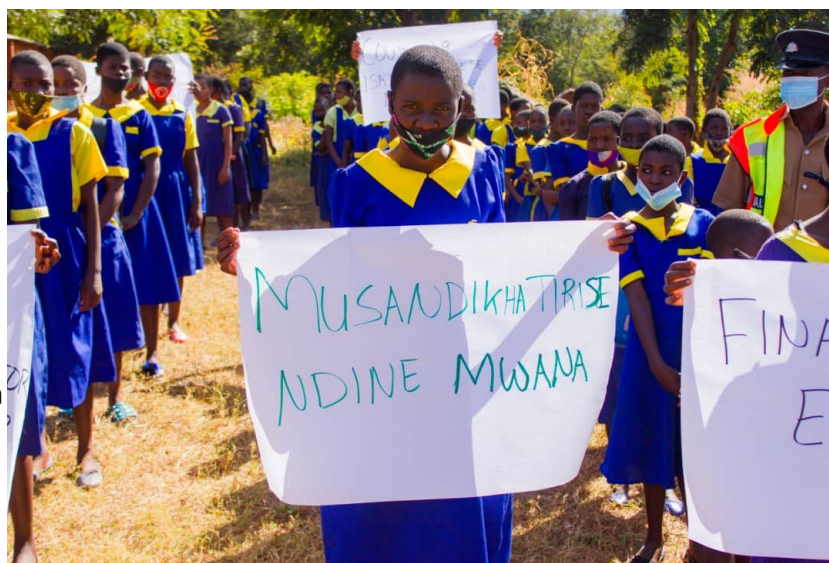
Don't marry me off, I am still young! Learners in Ntchisi making themselves clear through a solidarity march

Learners further requested authorities to provide adequate female teachers, teaching and learning materials, desks, schools school infrastructure and the eradication of violence in and out of schools and unpaid care work burdens which make them have less time for studies.