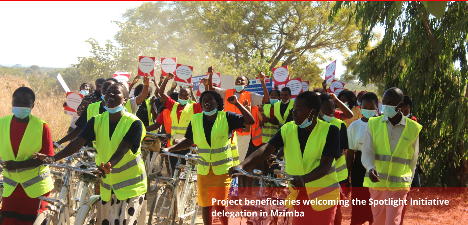
Project beneficiaries welcoming the Spotlight Initiative delegation in Mzimba