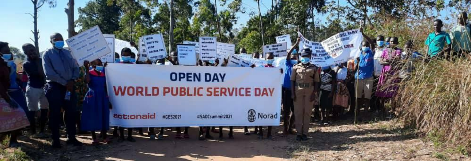
Primary school learners in Neno calling for gender-responsive public service through a solidarity march