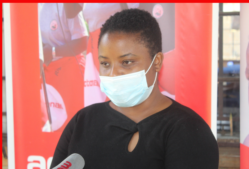
Chipeta addressing the media after the event