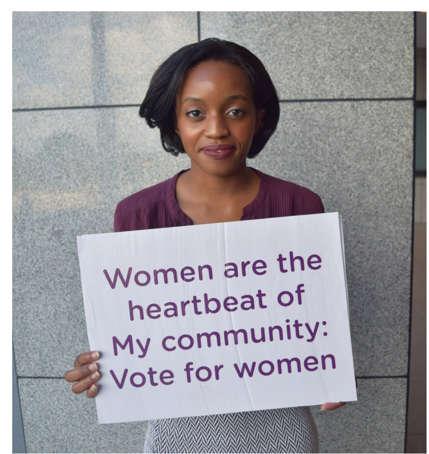
Win with Women: A young lady with a 50:50 placard during the IWD