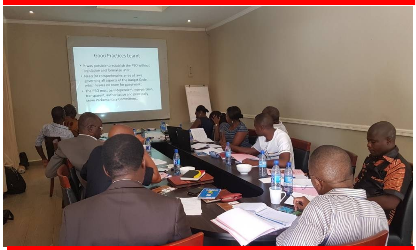
Making headway on social accountability: PBO tax-force during the meeting in Salima

Following an advocacy cam- ment of staff. paign by Action Aid Malawi (AAM) through its Swiss Agency for Development and Cooperation (SDC) funded "Strengthening Social countability and oversight in health and agriculture," project, the Malawi Government has kick-started the establishment of the Parliamentary ability Budget Office (PBO).