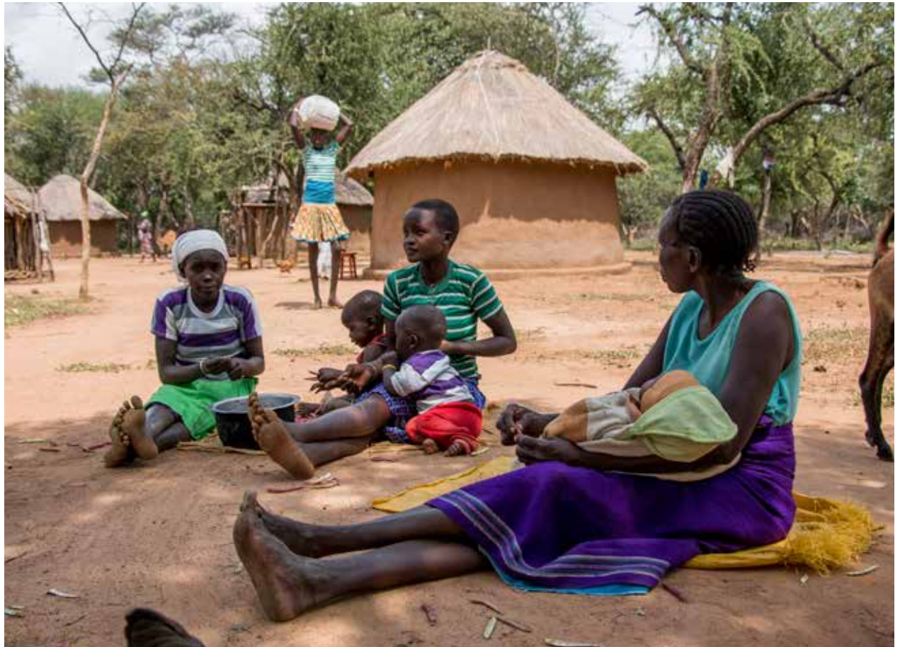
The life of women and girls in rural West Pokot, Kenya is dominated by unpaid care and domestic work.

Our fundamental concern is that a uniquely powerful institution, the IMF, is mandated by the international financial system to set guidelines for developing country economic policy working from the imperative to maintain certain indicators in a conventional band it judges sound for neoliberal capitalist systems. We maintain that governments have a broader obligation: to avoid financial and economic crises, yes, but to make their first priority the overall welfare of their citizens and environment. In other words, we argue for turning away from neo-liberal orthodoxy in favor of a rights-based perspective. The IMF would likely respond that there are other international institutions – UN agencies, most prominently – which work from this starting point. But countries rarely consult the UN Development Program (UNDP) or the United Nations Conference on Trade & Development (UNCTAD),