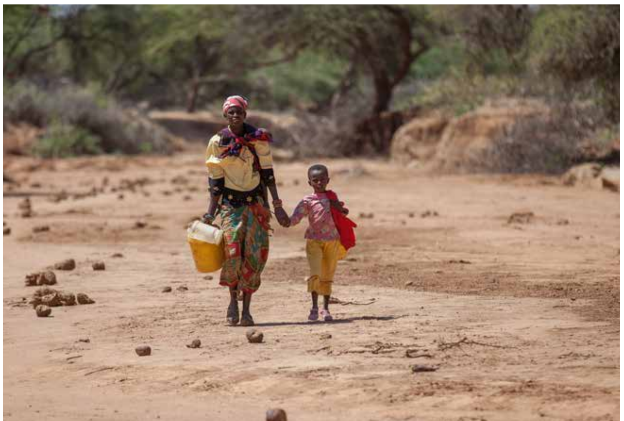
Walking long distances for water is unpaid work that falls on women and girls. Private companies rarely invest in new infrastructure in remote communities where there is little profit to be made.

SDG6 commits countries “to ensure availability and sustainable management of water and sanitation for all by 2030” with eight distinct goals ranging from access to water, to improved water quality, and better sanitation and hygiene. In practice there are many gaps. Over 2 billion people lack access to water that meets the new SDG standards and 844 million lack access to clean drinking water, whilst 2.3 million lack basic sanitation – an area where progress has been shockingly slow. There are huge inequalities both between and within countries, with half of the people drinking water from