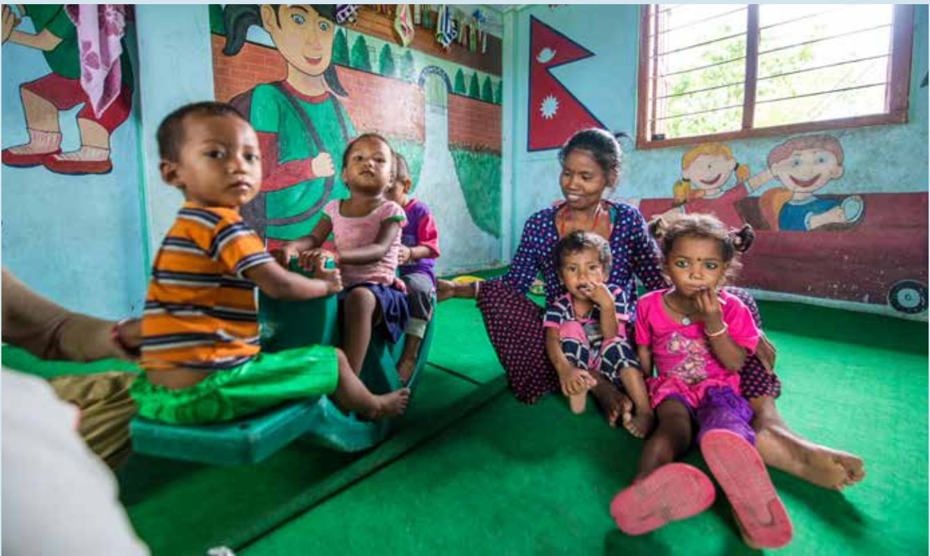
Community Child Care Center established in 2015, Bardiya, Nepal.

After the CCC, I have started cultivating vegetables and managed time to travel Nepalgunj and Mainapokhar (local market) to see them. I have also started livestock farming. Sometimes I go work as a wage labourer. This has tremendously boosted our family income. Earlier, since we were unable to pay fees, school asked us to stop sending my daughter. Now, we manage it easily. This has also reinstated the self-belief that I will do the work, earn and educate my daughter. I have also managed to invest in some capital. We bought a small piece of land in my name and took some land in mortgage. I have also started regularly saving some amount in the local saving group. Now, my family do not have to worry about food, clothes or education. We have been able to uplift our condition. My husband now works here in Nepal. He supports me with cultivation of vegetables, looking after cattle, and supports me in household chores. Even my younger son is developing and learning well in the CCC.