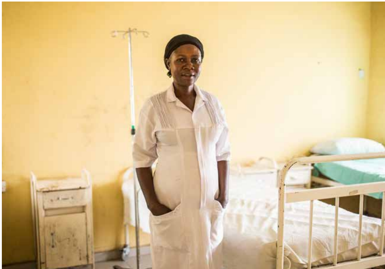
Orji is an unpaid nurse and midwife in a local hospital with no water source, no electricity and no government funding.

interviewed said they were working as volunteers, still pending confirmation of promised employment contracts from government, sometimes for several years. Those health extension workers who were employed by the government were untrained and ill-equipped and, complained of being so badly paid that they were unable to cater for their basic needs like transport and food. As a result, many health facilities are only open for 4-6 hours a day as is the case for example in Owode Oja community in Kwara State where the center opens at 10 and closes at 2pm and is unavailable at other times of the day regardless of the emergency. When emergencies do arise, women often have to go to general hospitals that are located 3 to 4 hours away from the community.