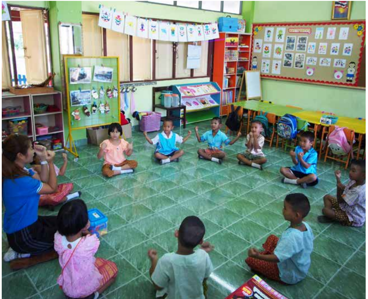
School in Supanburi Province, Thailand. Education budget constraints mean small schools in rural areas are threatened with closure. But these schools are often the only hope that many children have for getting an education. Abolishing unnecessary tax incentives could transform the education budget.

Rationalising tax incentives and removing the most harmful ones, including tax holidays and discretionary tax incentives which pose the largest challenge in terms of transparency and accountability, has thankfully become part of the standard advice of the IMF, as well as many other actors. While cost-benefit analyses of tax incentives remain a challenge in terms of providing a reliable insight into the real value of such measures, there are some promising experiences from countries like the Dominican Republic and international organisations supporting this area of research. 339