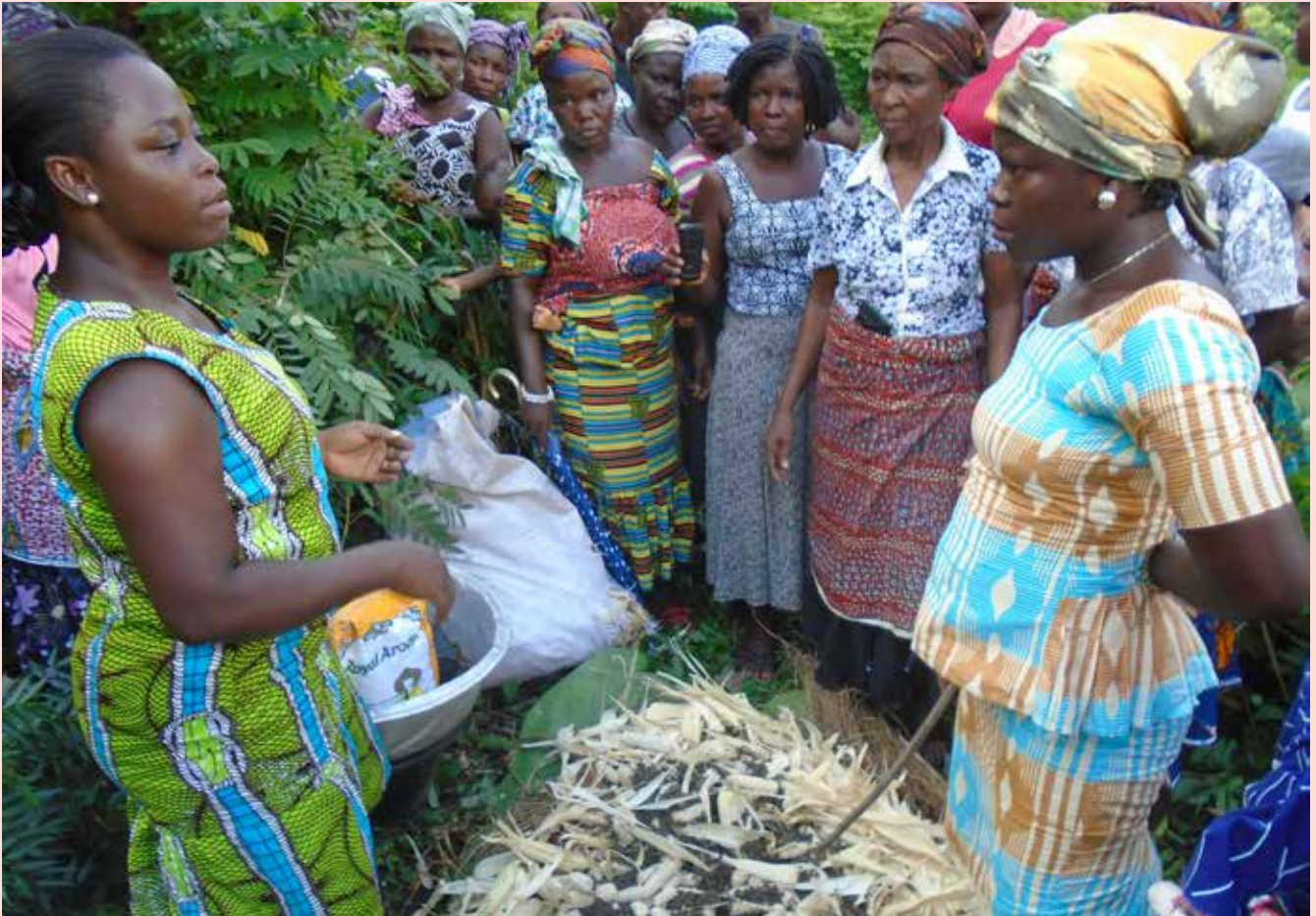
The priority for public investment in agricultural extension services is to support women smallholder farmers.

The Female Extension Volunteer (FEVs) programme in Ghana resulted from ActionAid's support for communities through participatory reflection processes. In these processes, a farmer-led extension support programme was identified as a way of bridging the extension gap. Selected female farmers identified as natural leaders in their communities were trained in agroecology practices and basic extension delivery methods. The FEVs were also supported with simple tools and logistics to enhance their work. The main focus of the FEVs is to promote agroecology and support smallholder farmers' transition to climate resilient sustainable agriculture. This programme has helped women smallholder farmers to take control of their agricultural production and food sovereignty, leading to increased and more sustainable agricultural production with less dependence on external inputs (e.g. through developing local seed banks and using crops residues for compost) and better connections to government agriculture extension services and other support programmes.