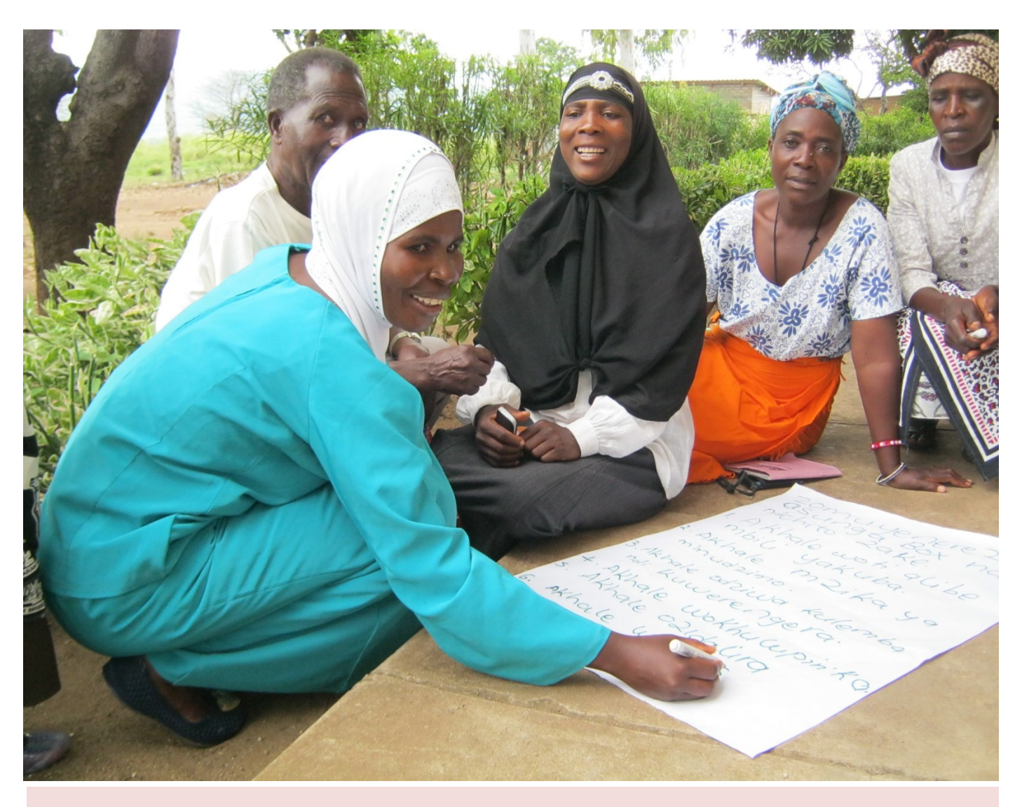
Members of one of the village savings and loans (VSL) in Machinga district

We promote and protect the rights of vulnerable groups and people living in poverty, in particular, women, girls, children and infected people with disabilities and the poor, and the excluded.