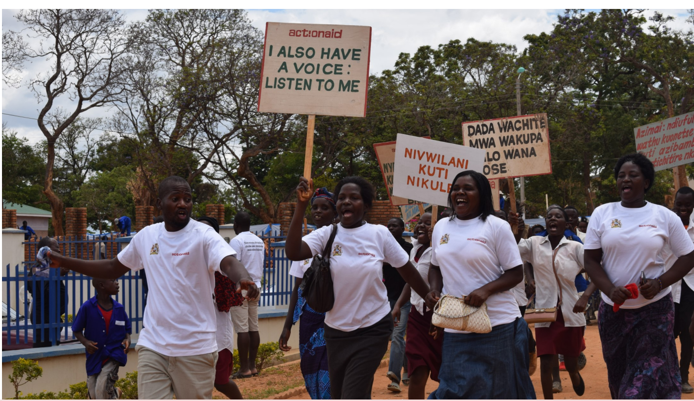
Marching during 2018 commemoration of 16 Days of Activism in Mzimba district

We work with Community Based Organizations (CBOs), local NGOs, networks, coalitions and various groups of people.