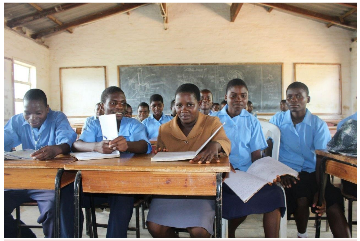
Students at Neno Mission Community Day Secondary School in Neno district

Under CSP V, ActionAid Malawi will therefore work with young women's movements, women's movements and women rights and feminists organizations to address the structural causes of violence, including the intersectionality between