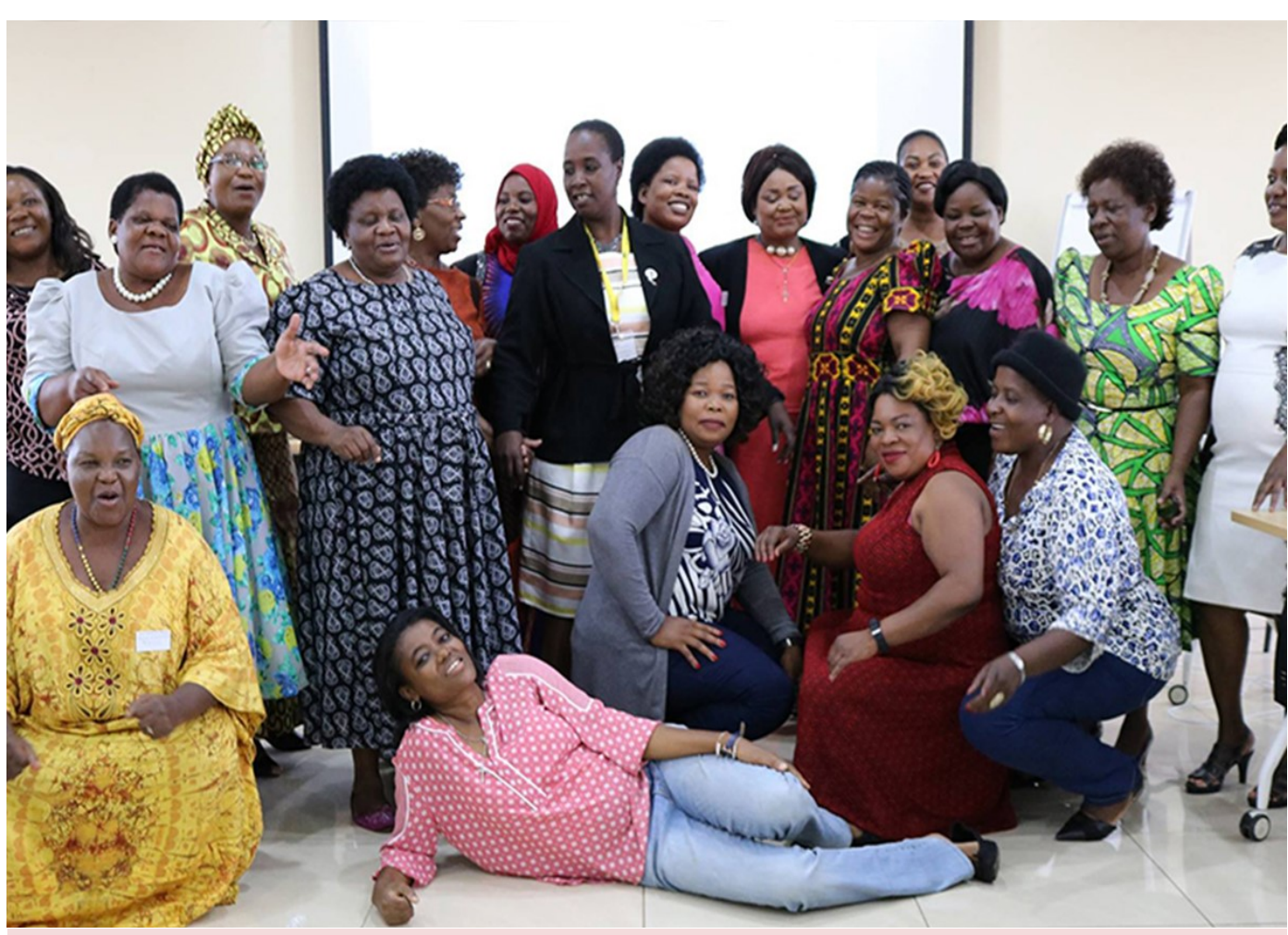
Female Parliamentarians in Malawi during one of the ActionAid meetings

Food and nutrition sovereignty, agro-ecology and natural resource rights and defense of the commons (natural resources for common good)